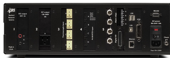
PTC10 rear panel

Macros are a powerful tool that can be used to tailor the behavior of the PTC10 for your experiment. For example, infinite-loop macros running as background tasks can take steps to address alarm conditions, automatically switch between sensor inputs (or heater outputs) depending on the current temperature or other factors, or implement cascade feedback schemes.