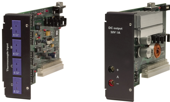
PTC330 Thermocouple Card PTC430 DC Output Card

isothermal block, with its own RTD temperature sensor, provides highly accurate cold junction measurements.